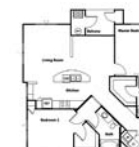
2 bed/2 bath