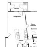
1 bed/1 bath