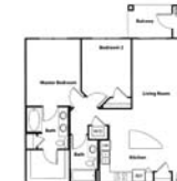
2 bed/2 bath