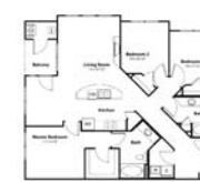
3 bed/2 bath