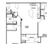
2 bed/2 bath