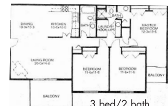
3 bed/2 bath