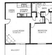
1 bed/1 bath