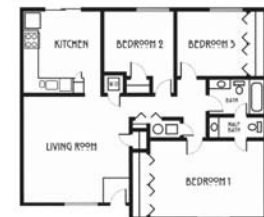
3 bed/1.5 bath