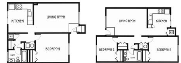
1 bed/1 bath