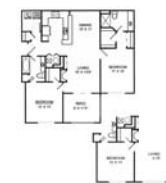
2 bed/2 bath