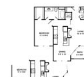
1 bed/1 bath