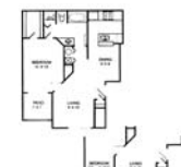
1 bed/1 bath