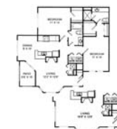
2 bed/2 bath