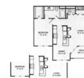
1 bed/1 bath