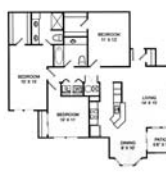
3 bed/2 bath