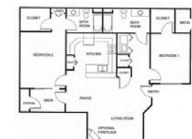
2 bed/2 bath