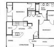
2 bed/1 bath