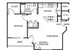
1 bed/1 bath