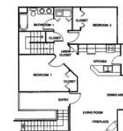
3 bed/2 bath