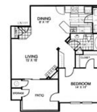
1 bed/1 bath