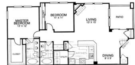
2 bed/2 bath