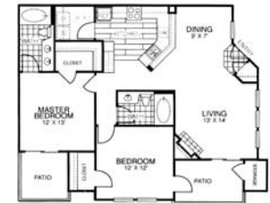
2 bed/2 bath