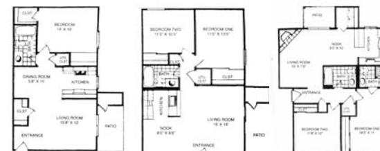
1 bed/1 bath 2 bed/1 bath 2 bed/2 bath