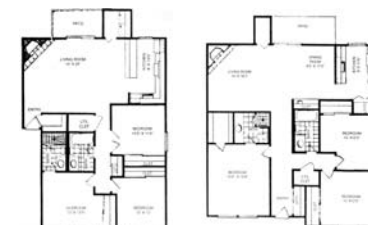
3 bed/2 bath 3 bed/2 bath