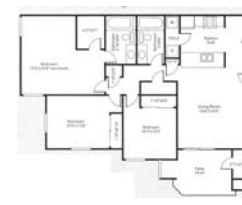
3 bed/2 bath