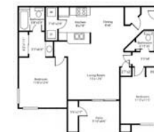
2 bed/2 bath