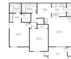
2 bed/2 bath