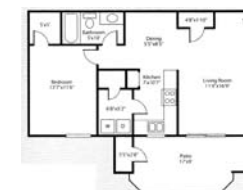
1 bed/1 bath