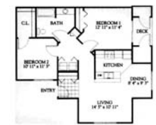
2 bed/1 bath