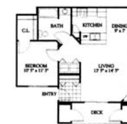
1 bed/1 bath