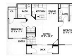
2 bed/2 bath