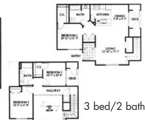
3 bed/2 bath