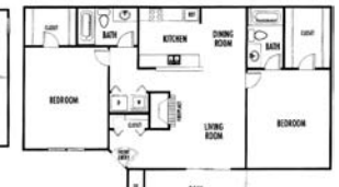
2 bed/2 bath