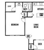
1 bed/1 bath