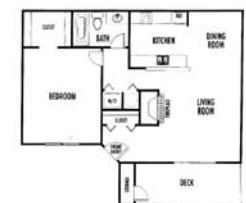
1 bed/1 bath