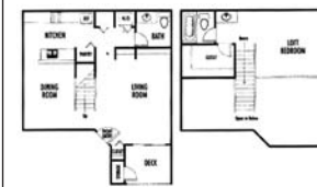
1 bed/1 bath