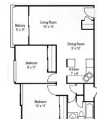
2 bed/1 bath