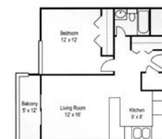
1 bed/1 bath