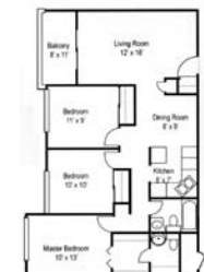
3 bed/1.5 bath