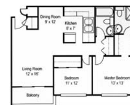
2 bed/2 bath