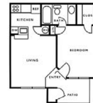
1 bed/1 bath Jr