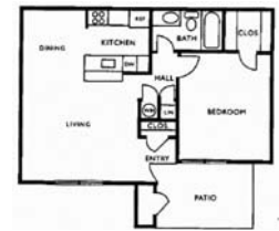
1 bed/1 bath