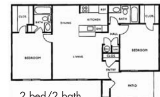
2 bed/2 bath