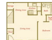
2 bed/1.5 bath