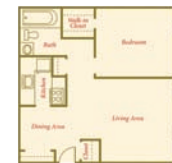
1 bed/1 bath