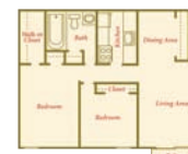
2 bed/1 bath