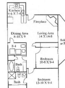
2 bed/2 bath