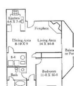
1 bed/1 bath