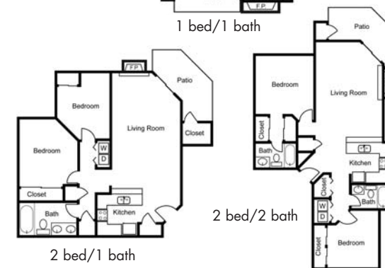
2 bed/2 bath