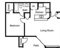
1 bed/1 bath